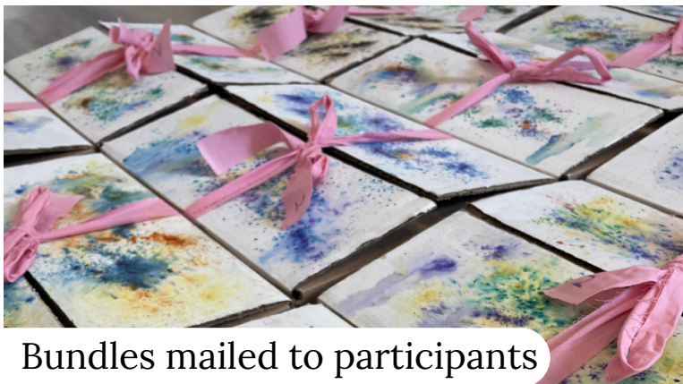
Bundles mailed to participants

Through live, online gatherings, video segments, and supporting materials, we integrate the natural world, simple art-making, yoga, sound, and discussion circles as we travel through our stories to chart a fresh course.